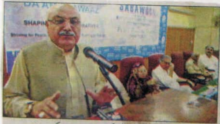
پشاور، وزیر اطلاعات میاں افتخار حسین سیمینار سے خطاب کر رہے ہیں

پشاور (خبر نامہ خصوصی) ایکسپریس نیوز کو ذرا پہلے سے اطلاعات میاں افتخار حسین نے کہا ہے کہ پاکستان، افغانستان اور امریکہ کو دہشتگردوں کیساتھ مذاکرے کی بجائے واضح کرنا ہوگا جس کے بعد تینوں ممالک باہم تعاون ملک دشمن عناصر کے خلاف مشترکہ کارروائی کا آغاز (باقی صفحہ 4 نمبر 21)